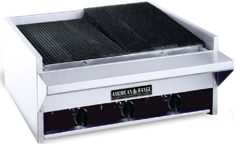
SHOWN WITH OPTIONAL STAINLESS STEEL LANDING LEDGE

All our quality counter appliances come standard with a stainless steel exterior and the best warranty in the business. Look to American Range for innovation, reliable performance, quality and attention to your equipment needs and delivery, now and in the future.